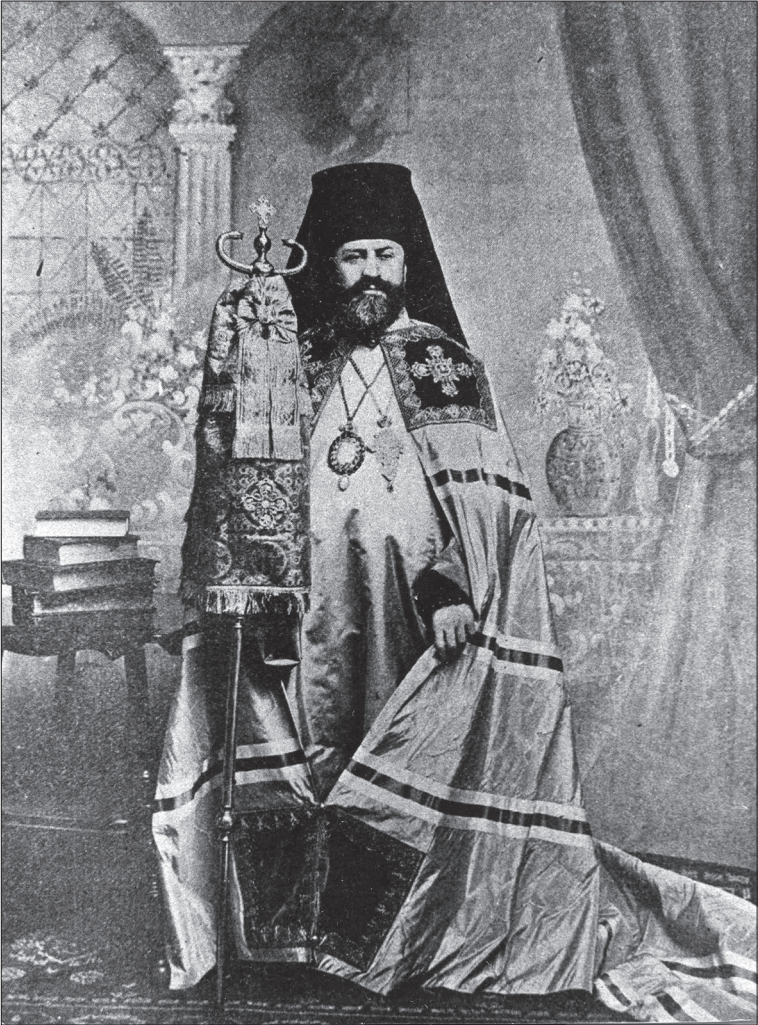
St. Raphael of Brooklyn