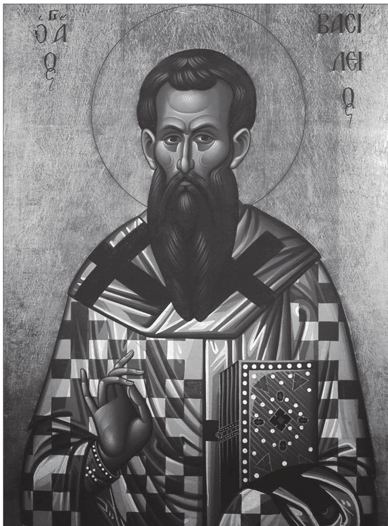
Saint Basil the Great