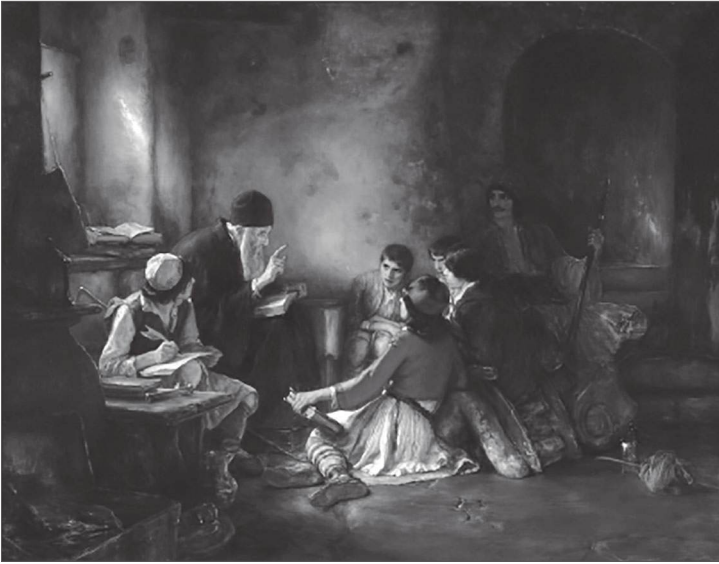
Nikolaos Gyzis, Oil on Canvas