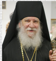
Bishop LUKE The Orthodox Ethos of the Russian Monastics of Holy Trinity Monastery