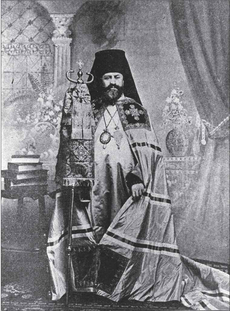
St. Raphael of Brooklyn