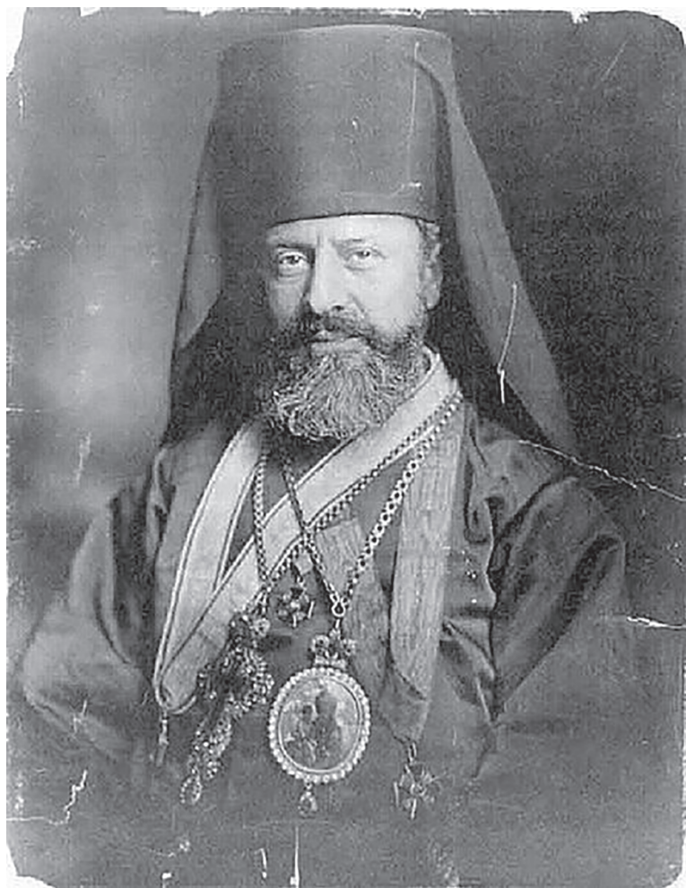
St. Raphael of Brooklyn